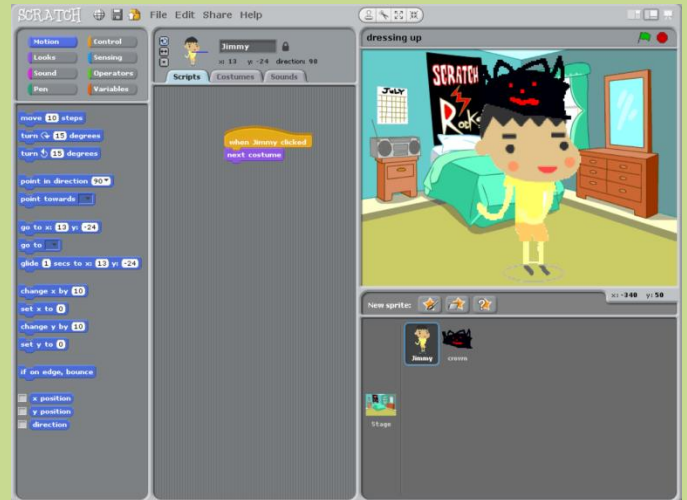
Year 2 Scratch - Dress Up Game

Look at the sentences below. All the spaces have been missed out. Can you put them back? Remember, only put one space between each word.