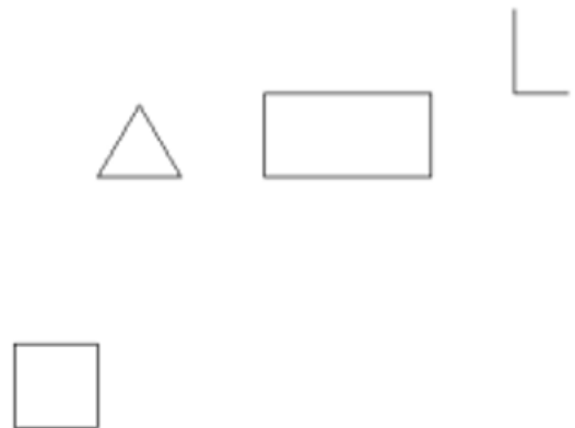
Year 4 Logo Programming

pd9 I don't know how to pd9 pd 9 You don't say what to do with 9 fd 9 rt 45 fd 24 lt 90 fd 60 bk 9 pu